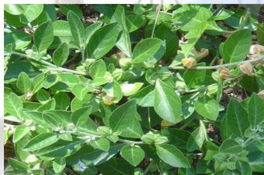
Fig .1: Withania somnifera

Kingdom: Plantae Order: Solanales Family: Solanaceae Genus: Withania Species: somnifera