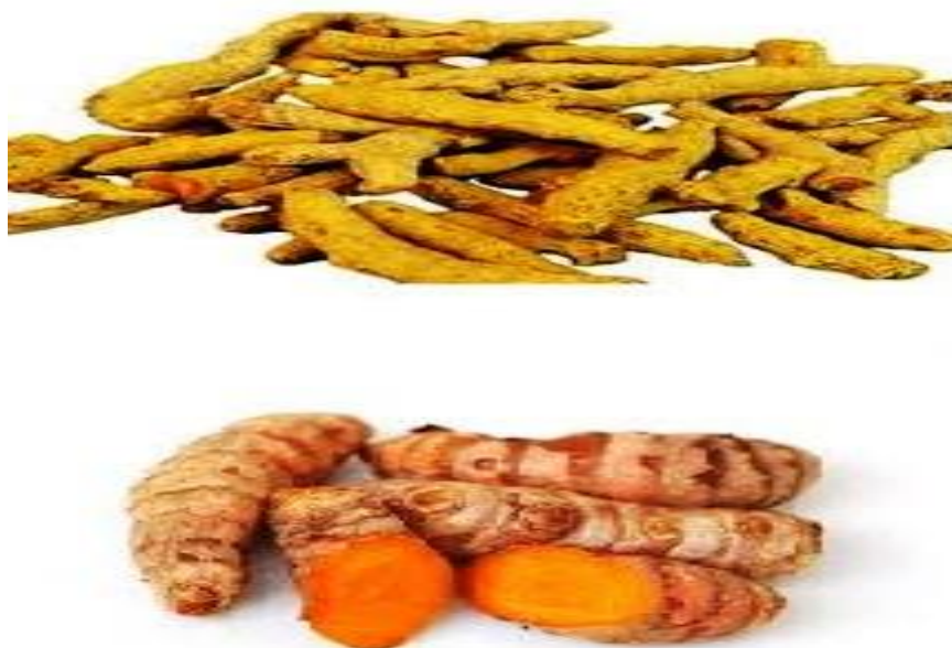
Fig. 3: Rhizomes of Curcuma longa