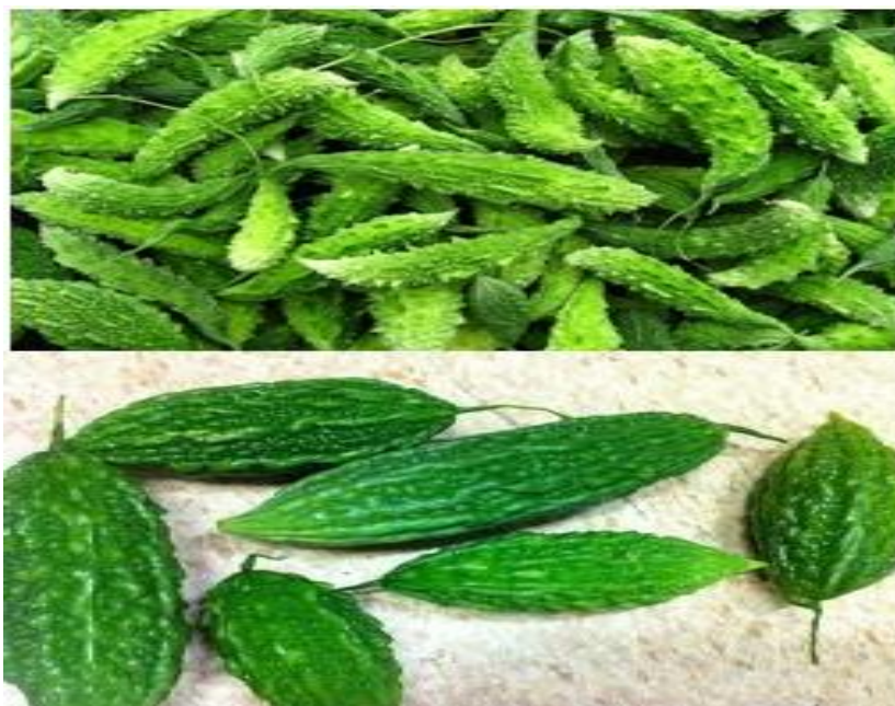
Fig. 2: Fruits of Momordica charantia