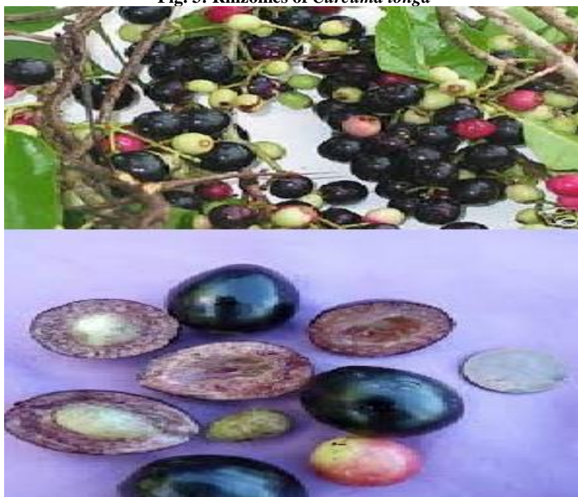
Fig. 4: Seeds of Eugenia jambolana