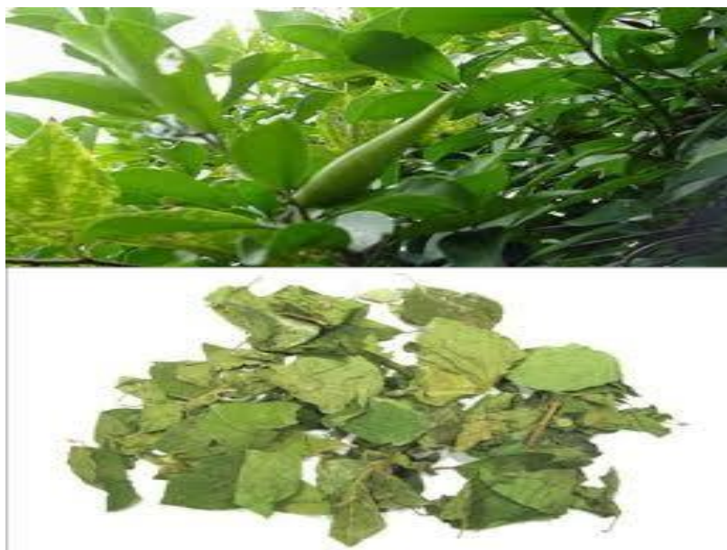
Fig. 1: Leaves of Gymnema sylvestre