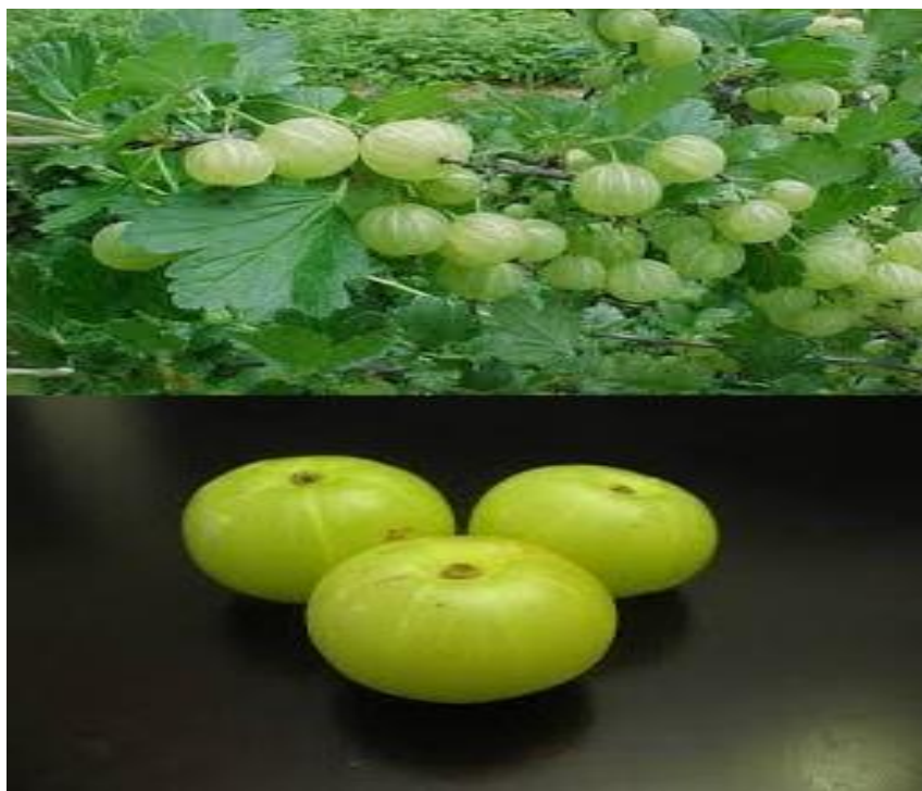
Fig. 5: Fruits of Emblica officinalis