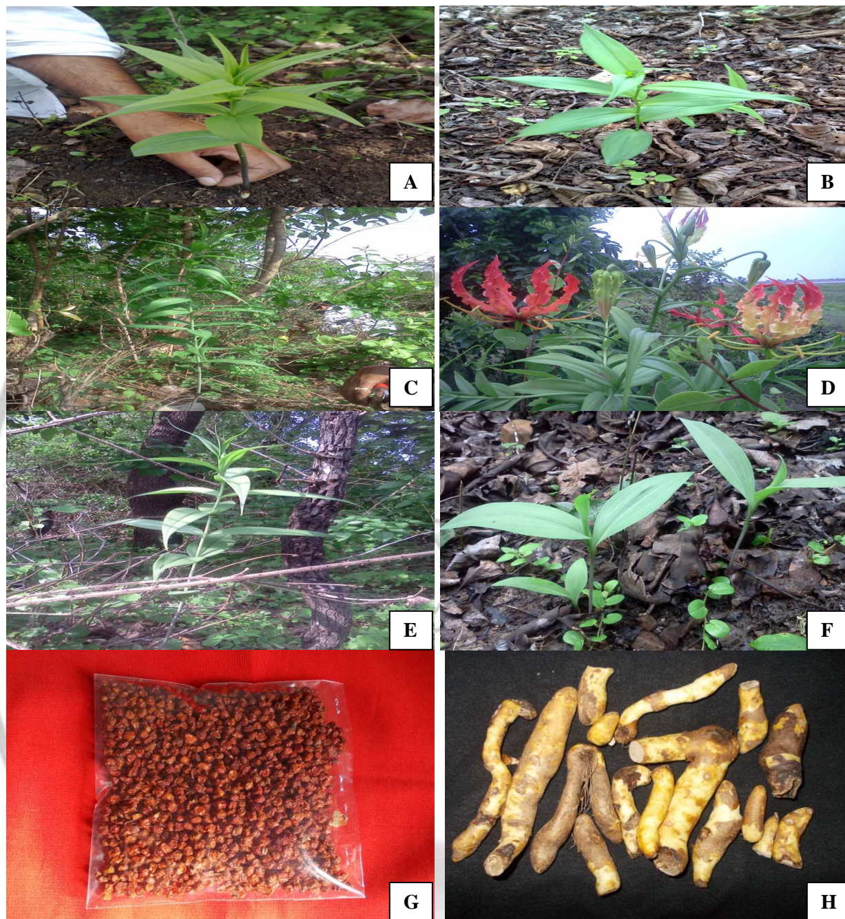
Fig. 1: Gloriosa superba growing in natural habitat at different places in PBR; (A) Badkachhar (B) Chhotianhoni (C) Matkuli (D) Dokrikheda (Near Dam) (E) Panarpaani (F) Tawa nagar (Near Tawa water Reservoir) (G) Gloriosa seeds collected from Tawa nagar (H) Gloriosa tubers collected from Dokrikheda.