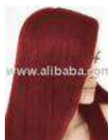
Heena Based Hair Colour