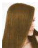
Chest Nut Brown