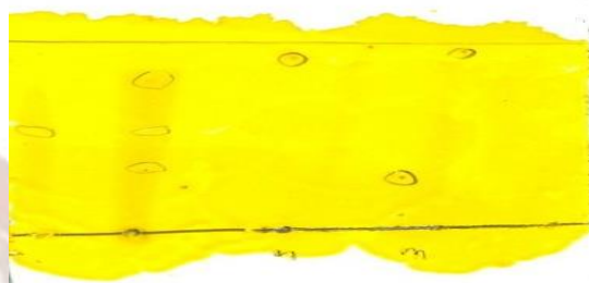
Fig. 2: TLC Plate showing spots of different solvent extracts of petiole of Oroxylum indicum