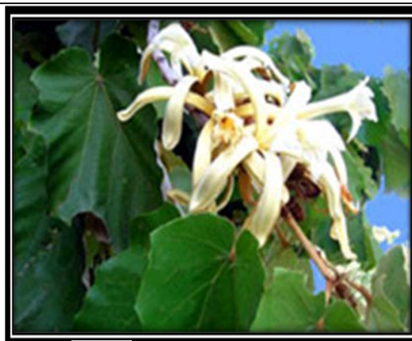
Fig. 1: Pterospermum acerifolium

Pterospermum is a flowering plant genus included in the family Sterculiaceae and most subsequent systematics. Pterospermum is based on two Greek words, "Pteron" and "Sperma," meaning "winged seed". It has a wide application in traditional system of Indian medicine for example, in ayurvedic anticancer treatment flowers are mixed with sugars and applied locally. Flowers and bark, charred and mixed with kamala applied for the treatment of smallpox. Flowers made into paste with rice water used as application for hemicranias. Stem bark of the plant was found to have antimicrobial activity. Isolation of boscalin glucosides from leaves of P. acerifolium has been reported. Hepatoprotective effect of ethanolic extract of leaves of P. acerifolium was also reported. Chronic effects of P. acerifolium on glycemic and lipidemic status of type 2 model diabetic rats was found beneficial. The barks are reported to be used as anti-ulcer, anti-inflammatory, analgesic and anti-oxidant activity 1 . The present work was undertaken to evaluate the in-vitro antioxidant activity of the plant.