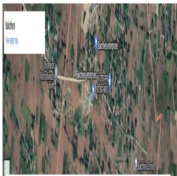
Fig. 1: Location of Bakchhera Dam in Rewa District

The census code of this hamlet is 467336, which is located in Raipur - Karchuliyan Tahsil of Rewa in Madhya Pradesh, India. The total area of this village is 281.71 Hectares. The Tahsildar office is located in Raipur - Karchuliyan and it is 8.0 kilometre distance from this location.