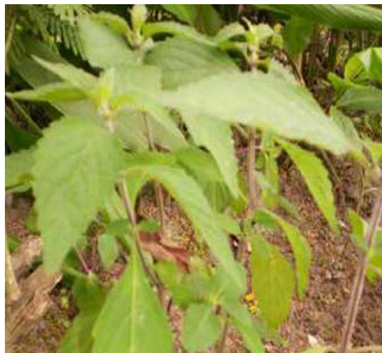
Fig. 1: Plant: Meriandra dianthera (Roth ex Roem. & Schult.) Briq.

to the extraction and characterisation of four abietane diterpenoids. [3-4]